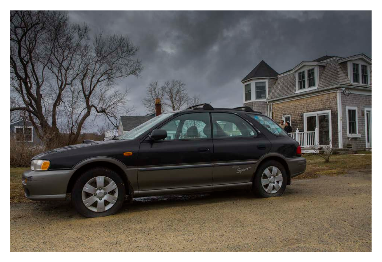
"Two advanced degrees, two flat tires, no motor, no money" tells the story of a highly educated couple in an unstable job market that face foreclosure and are unable even to afford necessary repairs on their car.